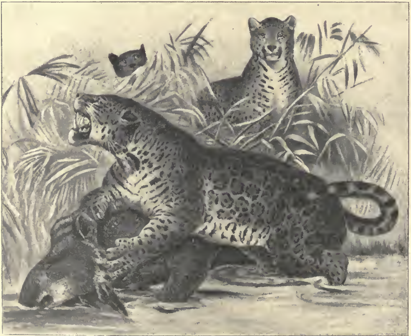
FIG. XLI. FELIS ONCA. JAGUAR. 1. Felis onca ; 2. Felis o. hernandezi .

2. Adult ♂ Melanistic form. P. Java. Ward's Nat. Scien. Establ., Rochester, N. Y.